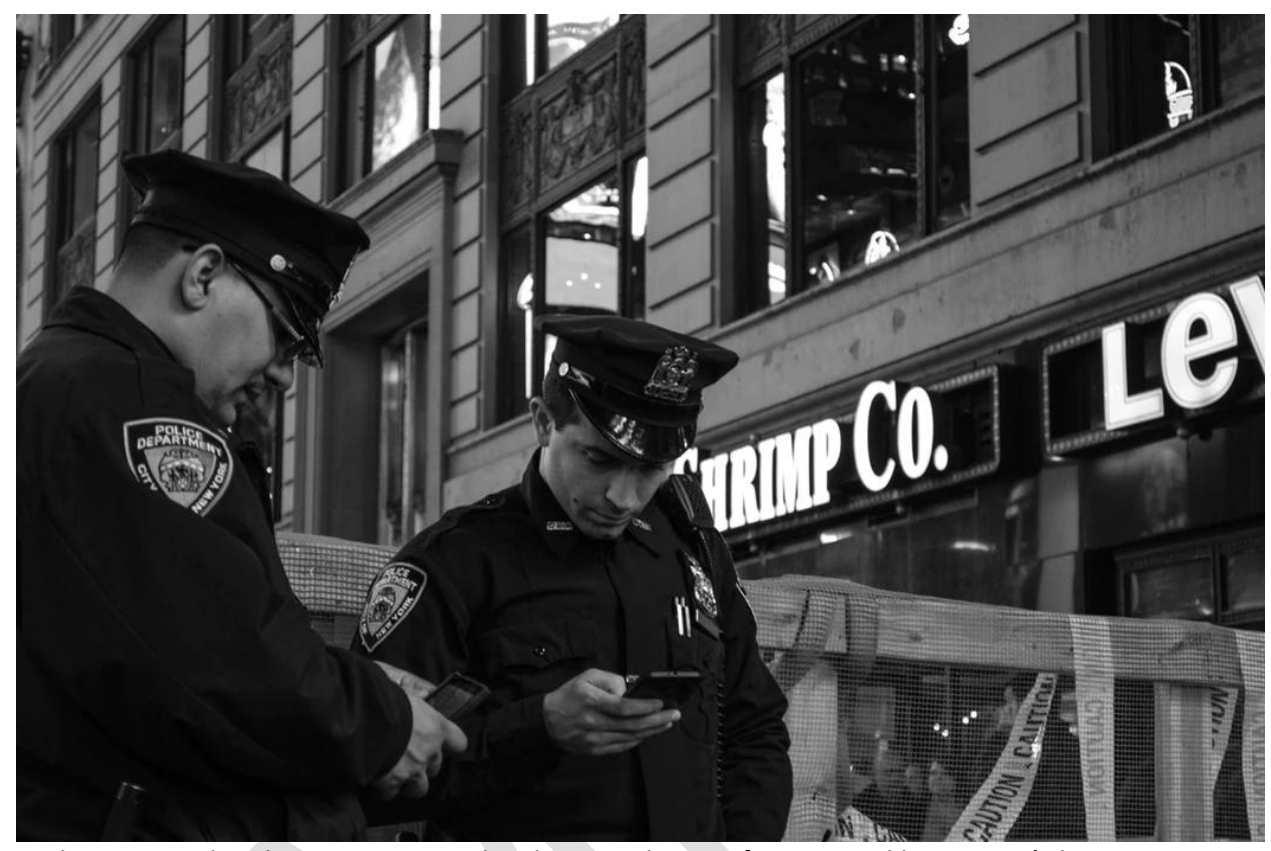
8. The New York Police Department has become known for its racial bias. Here's how it can fight it: